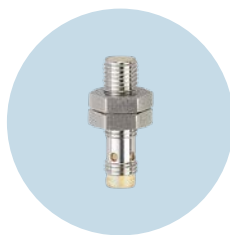
Inductive sensors M8 Compact housings and long sensing ranges