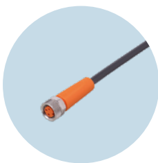
Connection cables M8 Reliable connections for harsh environments