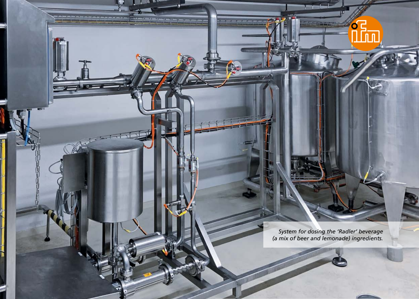
System for dosing the 'Radler' beverage (a mix of beer and lemonade) ingredients.