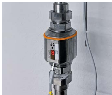
The flow sensor transmits several measured values to the control system via IO-Link.

The Meckatzer brewery has been closely networked with ifm for many years and already participated in several field tests in the past. Since ifm products have been consistently equipped with IO-Link the last few years and the technology is very interesting, it was obvious for us to use it also in a complete project. The plant was manageable in terms of size and it was a good point to start from.